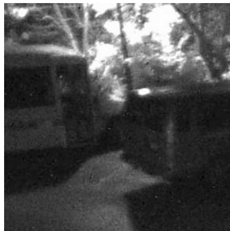
Under the same conditions except replacing the standard lens with a day/night lens such as Theia's new SY110 lens keeps the image in focus day and night.

Theia's new SY110 lens provides day/night performance for megapixel cameras in applications such as parking lots, warehouses, power transformer lots, lobbies, ATMs, etc. Any place where a large area or wide angle of view is needed, the SY110 lens can give up to 120 degree horizontal field of view without distortion.