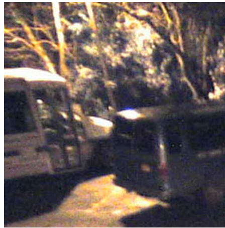
In this parking lot there is sufficient visible illumination that a standard camera and lens such as Theia's SY125 lens can be used at night. The section indicated by the yellow box in the left image is magnified in the right image.

When there is adequate visible light at night, a non-day/night lens, like Theia's SY125 lens for example, can be used with a standard, non-day/night camera. The SY125 lens, with its 135 degree field of view without fisheye distortion can be used when an ultra wide field of view is needed. The lens supports cameras up to five megapixels in applications such as malls, prisons, public spaces, and mobile surveillance platforms to name a few.